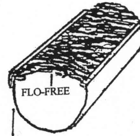
5" Half Round Gutter

D. Run a continuous bead of silicone caulk along the front edge of the gutter. Carefully position the front edge of the FLO-FREE strip along the caulk line, by just touching the FLO-FREE to the caulked edge of the gutter.